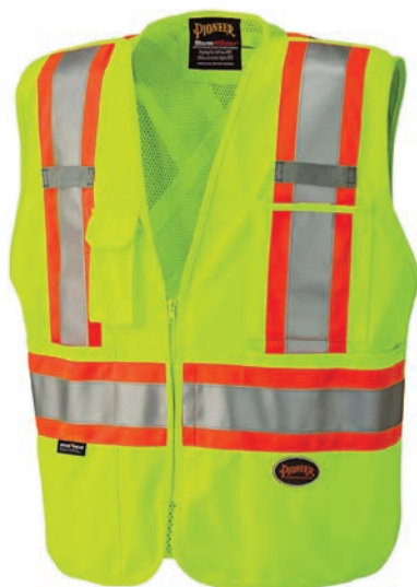
Hi-Vis 5 Point Safety Vest L • Yellow 899.0736-L

899.406709 • L Mechanic's gloves that provide full coverage hand protection