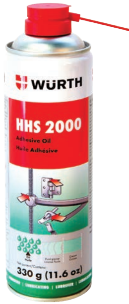
HHS 2000 893.106 • 335 g