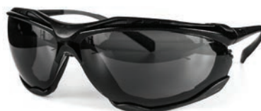
Nova Safety Glasses Blk Tmpl/Grey Anti-Fog Lens 899.103220