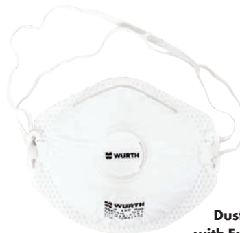
Dust Mask N95 with Exhale Valve 899.120002 • 10/Box