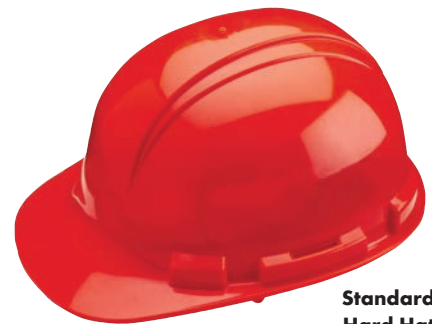
Standard Hard Hat 899.200005 • Red