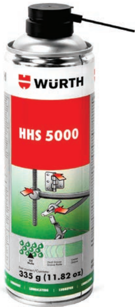
HHS 5000 893.1063 • 335 g