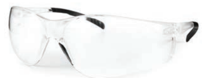
Fission Safety Glasses Blk Tmpl/ Clear Lens 899.103200